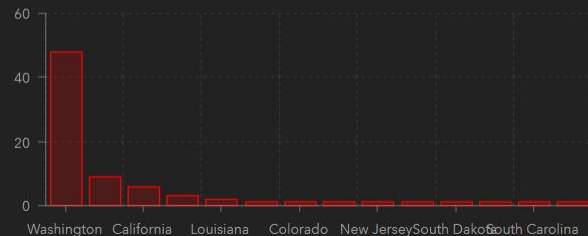
Deaths Per State