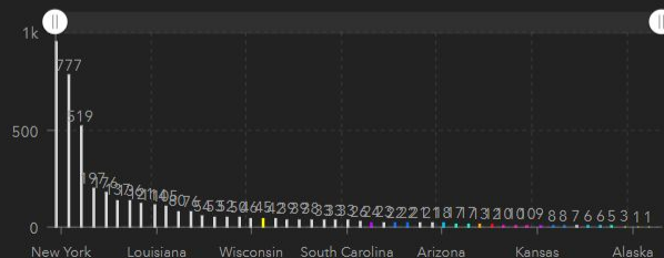
Number of Cases Per State