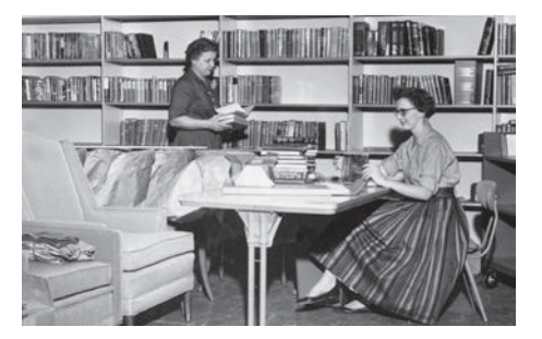
Ottawa Hills Branch librarian and clerk pose for a photograph

The Library Board turned to neighbors in 1956 to select a name for the new branch. A total of 43 entries were submitted from community members, including students. Names such as New Library Hall, Nook of Knowledge and Treasure Lore were suggested. A majority of the suggestions, however, included the words Ottawa and Hills, showing a strong sense of connection with the neighborhood. Taking this input seriously, the Library Board decided to name the branch the Ottawa Hills Library.