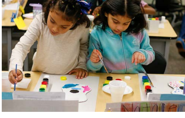
Sibley Elementary scholars working on their guitar paintings